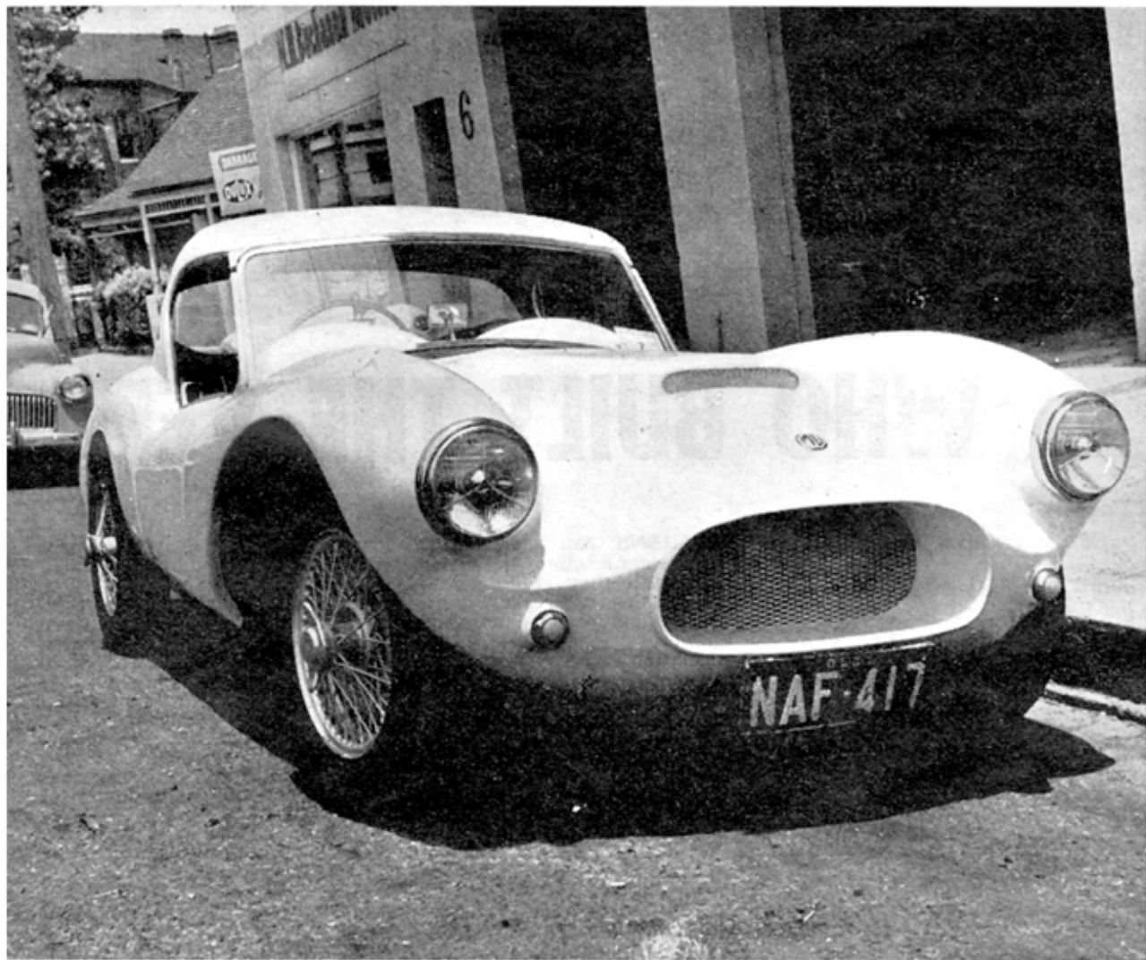
Greatly enhancing the appearance of the body, this hardtop on a Buchanan-bodied M.G. looks neat and offers some weather protection.

Current trend throughout the world is the specialised custom-built hardtop which turns the windblown sportster into a comfortable luxurious coupe for special occasions. Australia holds her own in this field, as our story shows.